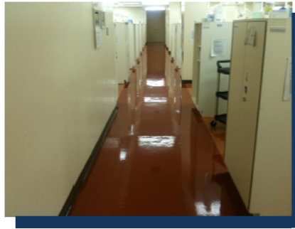
Picture: Floors at Dalhousie University